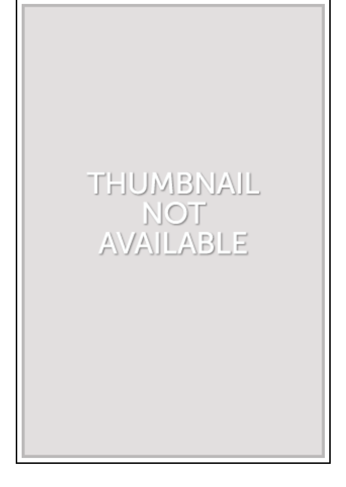
Filesize: 4 MB